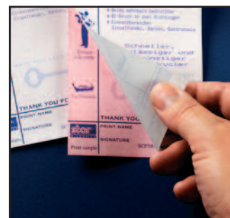
Original + 2 Copies