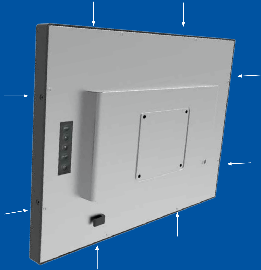
Vesa 100x100 mount or bracket mount