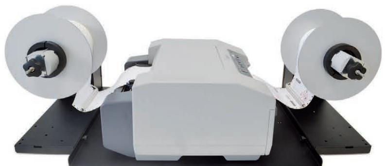
EPSON C831 printer with ASD1134-S4 and ASS1134-S4